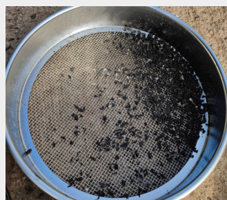
2-4mm (10% wt)