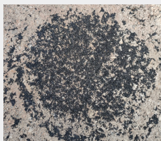
<1mm (10% wt)