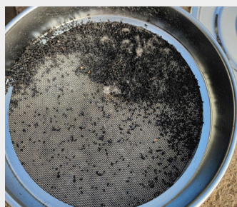
1-2mm (8% wt)