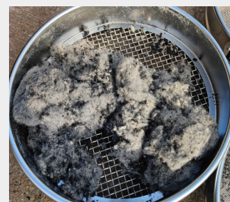
>4mm (72% wt)