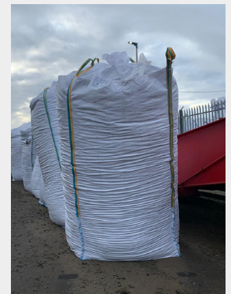
Packing: 2m bulk bag Unit weight: 1 tonne